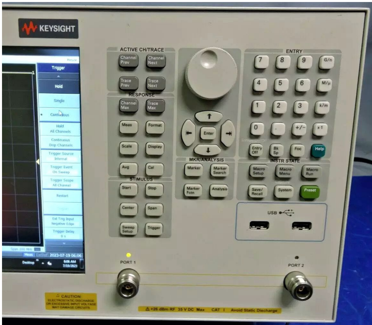
Figure 1 Keysight E5063A Network Analyzer front panel (right side)